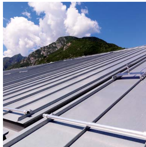
The natural installation use of zintek® is for covering solutions, façades and tinsmithery.

zintek® is a zinc, copper and titanium alloy, produced starting from 99,995% quality zinc, in compliance with European Standard EN 1179, with the addition of alloying elements. The zintek® laminate is compliant with European Standard EN 988 - zinc and zinc alloys. Specification for rolled flat products for building.