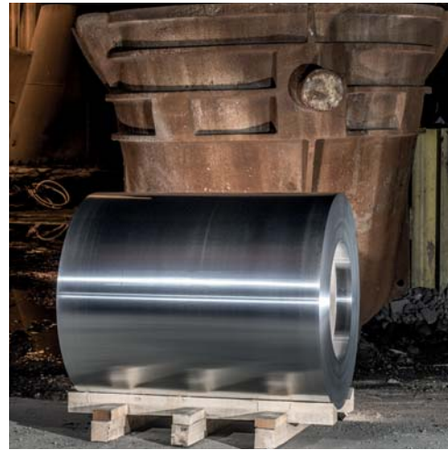
The natural look of zintek® is a glossy grey laminate.