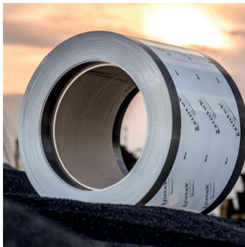
The natural appearance of the laminate can be changed with special surface treatments.