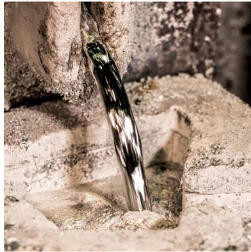
Smelting of the zinc with alloying elements (copper and titanium).