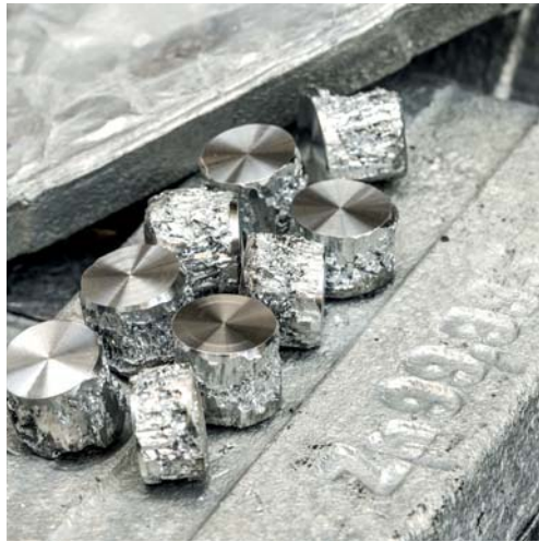
Zinc crystals from zinc compliant with European Standard EN 1179.