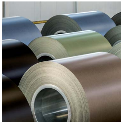
The Colored Ones, the new line of colored laminates.